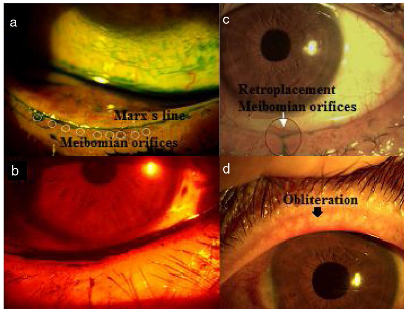
Figure 1 Lid margin. (a) Extension of green lissamine toward meibomian orifices: Marx's line; (b) red filter show irregularity of lid margin; (c) retroplacement of Meibomian orifices; (d) obliteration. The punctum of the orifice may not be visible and vascular invasion is visible.