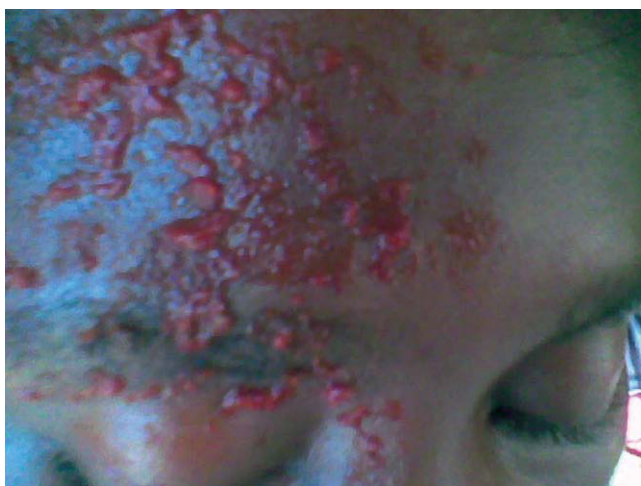
Figure 1 Rashes distributed along the ophthalmic branches of the right Trigeminal of the patient.

Nummular keratitis is seen beneath the Bowman's membrane in 33% of patients, 10 days after the onset of rashes. The lesion is characterized by multiple ne granular deposits which are surrounded by a halo of stromal haze. Lesions may resolve without trace or become indolent with chronic cellular and lipid inltration that impair vision.