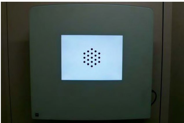
Figure 3 Astigmatism-sensitive optotype.

addition, higher addition ( +2.00 D) is adopted for better trends in image blur perception. Two PAL trial frames (Figure 2) were prepared with two different trial lens systems (combination of plano distance PAL and spherical power single vision lens for TPAL, and combination of spherical power distance PAL and plano power single vision lens for FPAL). The sequence of the dual lenses mounted was that PAL (plano-distance or spherical power distance) was placed close to the eye, and single vision lens was mounted in front of the PAL lens. Pantoscopic tilt angle and back vertex distance of trial frame were adjusted to 10 degrees and 12 mm respectively. Subject's pupil center was matched exactly with the PAL fitting point.