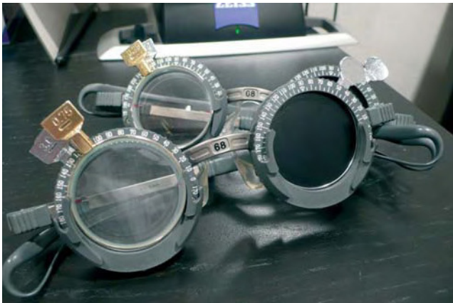
Figure 2 PAL trial frames.