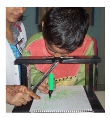
Fig. 4 Showing a child using the Cheiroscope.

suppression and improves hand-eye coordination.<sup>7,8</sup> For HBT, the patients were advised Red-Green HART chart reading, and red-filter exercises like filling letter 'O' with red pen and drawing for 30 min every day. The red-filter exercises differ from the red-green HART chart reading. The red filter (the lens that blocks red color light) is worn in front of the suppressed eye as the good eye is occluded while the child uses a red color pencil or pen to do the writing tasks so that the suppressed eye's cone cells dominating fovea is stimulated. During the maintenance phase, only red-filter letter 'O' filling exercise was advised for 30 min each, two times a week.