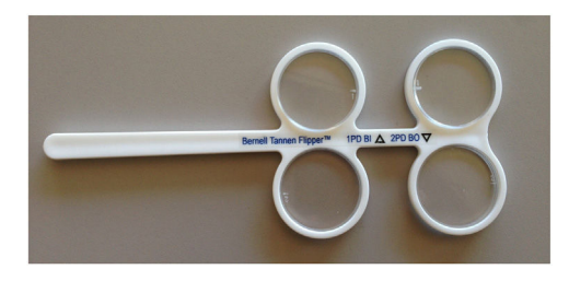
Fig. 1 The TFT flippers.

multiple sclerosis. None in this last group had a history of a C/ mTBI.