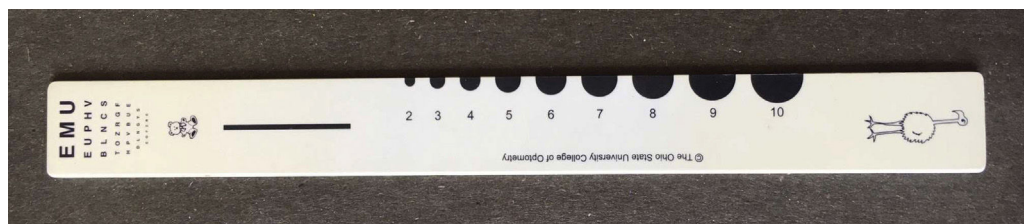
Figure 1 Ruler used for gross assessment of pupil size. The numbers adjacent to the black “half moons” indicate the pupil diameter in millimeters. Pupils of size determined to be between two of the “half moons” were assigned a size half way between the two. For example, if the pupil size was between that of number 4 and number 5, the size was assigned a value of 4.5 mm.

To determine whether the proportion of subjects with anisocoria \geq 0.5 mm differed based on the method of assessment, McNemar’s test of within-subjects proportions was used to compare the gross measurement technique with the infrared photograph technique. For horizontal anisocoria assessed under photopic conditions, the unsigned difference in proportions was 0.4425 (two-tailed p < .000001 , odds