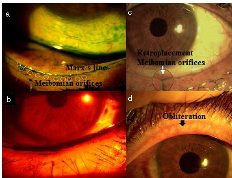
Figure 1 Lid margin. (a) Extension of green lissamine toward meibomian orifices: Marx's line; (b) red filter show irregularity of lid margin; (c) retroplacement of Meibomian orifices; (d) obliteration. The punctum of the orifice may not be visible and vascular invasion is visible.